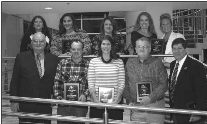
Award winners above and past and present members of The Arc's Board of Directors at right at the 2014 Annual Awards Banquet and Fashion Show.