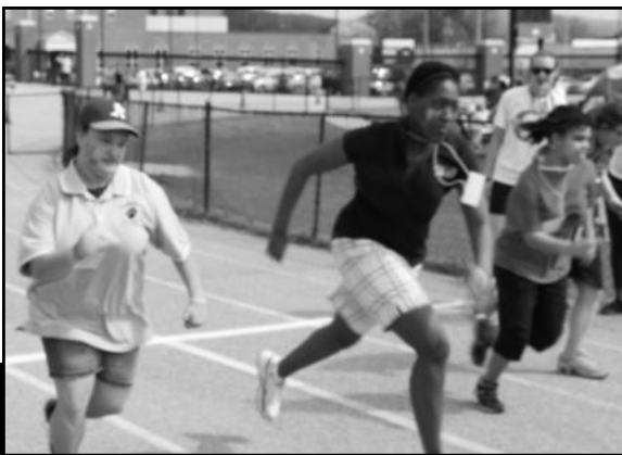
Wellborn, Anniston, Alexandria and Jacksonville runners compete, right