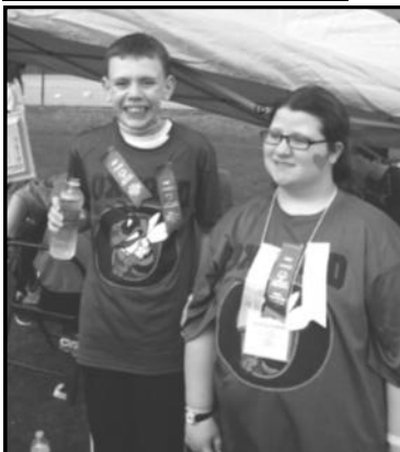
Oxford Middle School students take a break.

Students from the Oxford, Ohatchee, Wellborn, Jacksonville, White Plains, Cleburne County, Anniston and Alexandria High Schools served as buddies to the athletes, making sure they enjoyed the day. Other OHS Key Club members set up the field and organized fun events for the participants to enjoy when not competing.